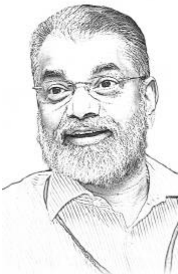
Space should become the bedrock on which national systems for societal & other national imperatives are built up K RADHAKRISHNAN CHAIRMAN, ISRO

ADVANCED research should be undertaken in tandem with academia on cutting-edge technologies targeting to make India a technology leader in niche areas. The ISRO saga needs to be carried forward ensuring higher level of excellence and deeper relevance to the society. It has been a great opportunity for one to be part of the ISRO family.